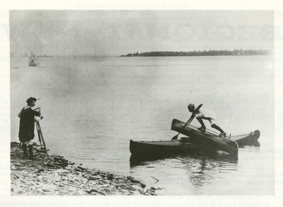
C. Boyer Vaux balancing canoes, about 1890.