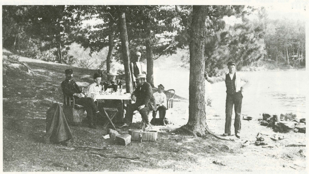
Riverside picnic, about 1900.

These photographs, provided to ROOTDRINKER MAGAZINE by the Shipyard Museum in Clayton, New York, recall simpler, quieter times on the river — recall an era of clear skies and carefree laughter.