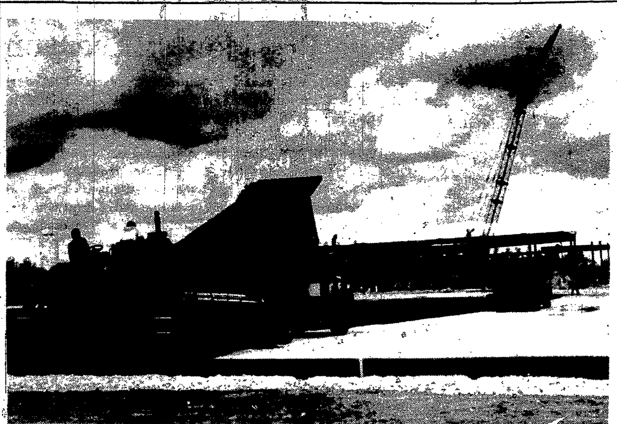
Construction has begun at the site of the new P&C shopping center, located next to the Evergreen bar.

Wells said the volunteer work demonstrates "the caring, concern, courtesy and commitment" that signifies Canton.