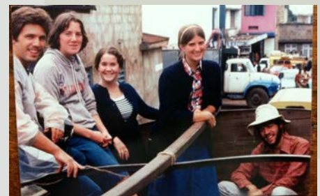
Students on the "Nairobi" Semester in 1978