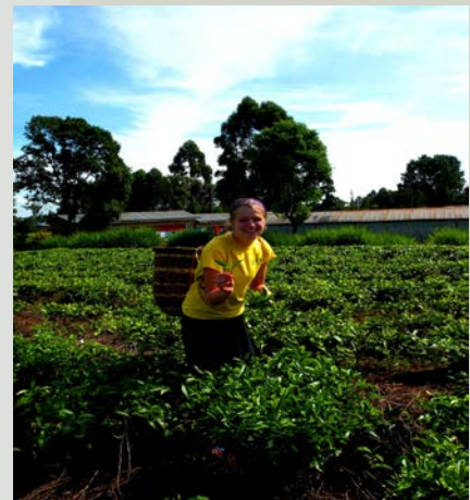
Student practices a lesson in plucking tea during a rural homestay