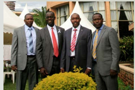
Four former SLU scholarship winners elected to the Kenyan Parliament in 2013. Not shown is Judi Wakhungu '83 Kenya's current Cabinet Secretary for Environment, Water and Natural Resources.