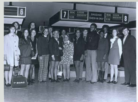
First J-Term Trip to Kenya in 1972