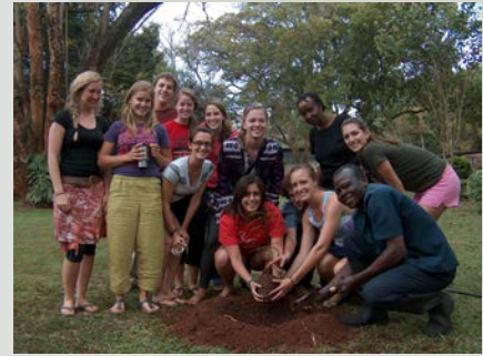
Students plant a tree at the Nairobi campus in honor of the late Kenyan Nobel Laureate Wangari Maathai.

Karibuni Canton and Please Encourage your Fellow KSP Alumni to Attend This Exciting Event