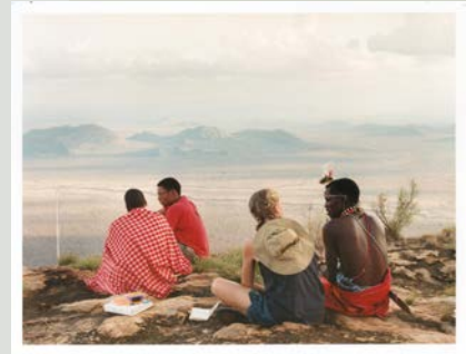
Students learn about pastoralist lifestyles from their Samburu teachers during a field component