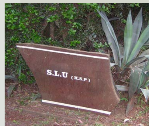
Welcome to the St. Lawrence Nairobi Campus in Karen