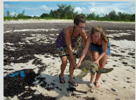
Students Study wildlife conservation on the Indian Ocean coast during the Independent Study Component