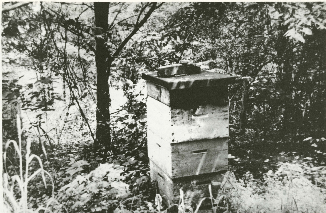
Beehive in a glade near Norwood, N.Y.